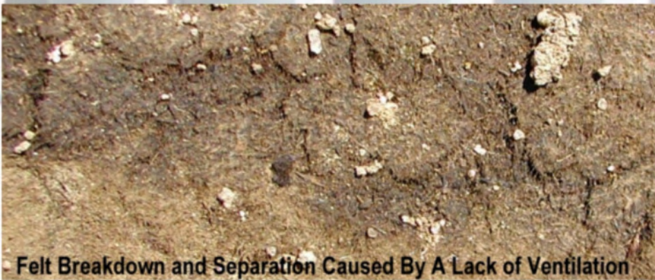
Felt Breakdown and Separation Caused By A Lack of Ventilation